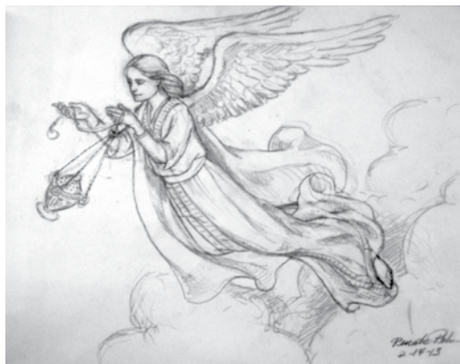
The two angels with censers will go on either side of the Sacred Heart statue. The third is for the Benefactors' Wall. All three are currently still available for memorialization.