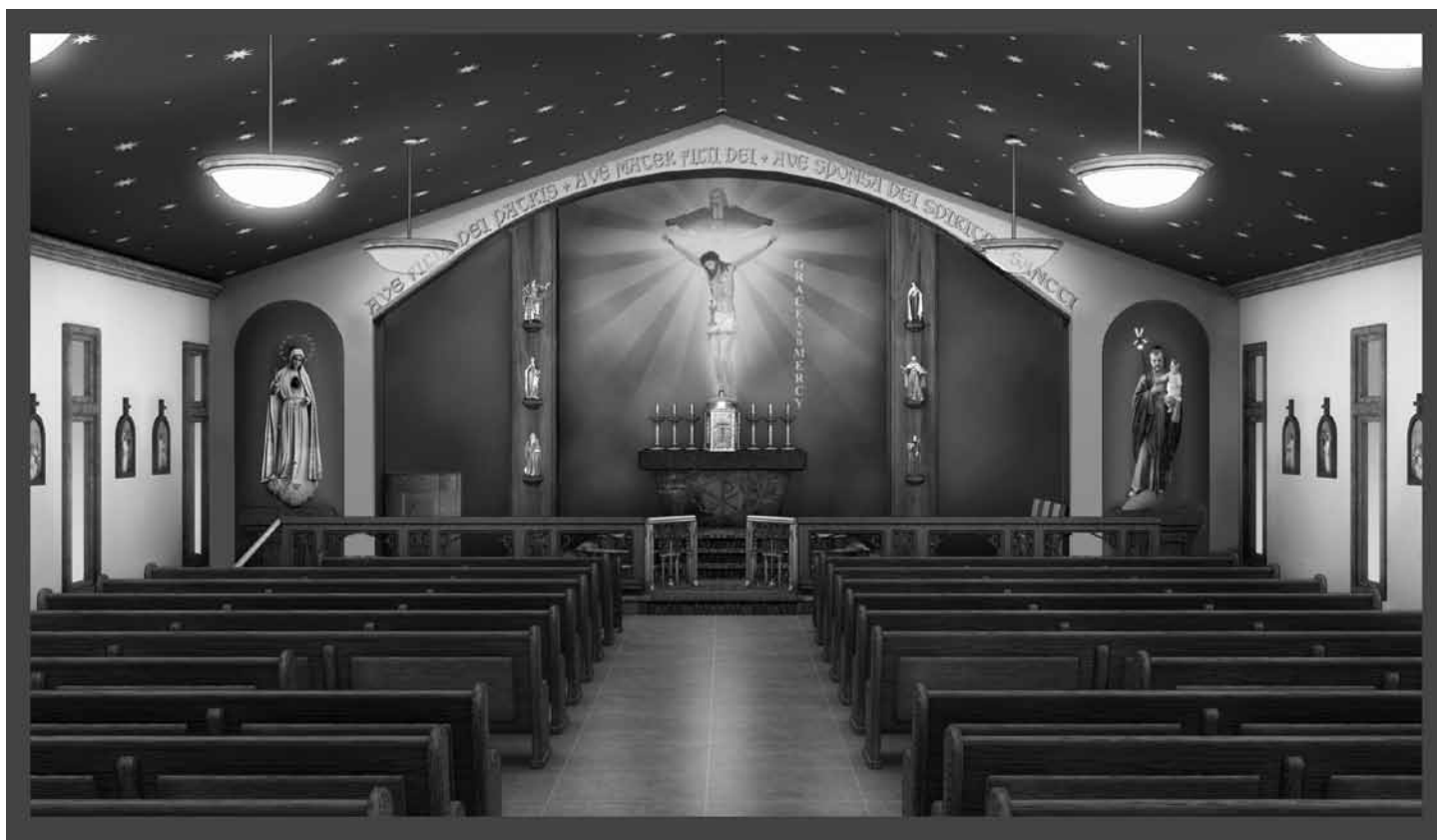
The artistic 3-D rendering of the chapel was made by Owen Carson.

We can start with a gold one, but then we need a full set in all the liturgical colors. (price still to be determined)