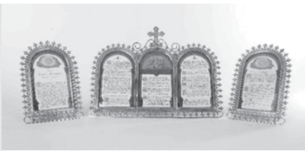
Altar Cards in Romanesque Brass Frames ($1500)