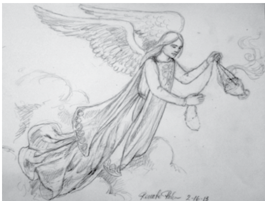
The angels on this page are the preliminary sketches for the angels on the back wall.

shrines we know and love around the world? Those who built the shrines had the Faith that we claim to want to restore in the Church. Instead of placing their hopes in material