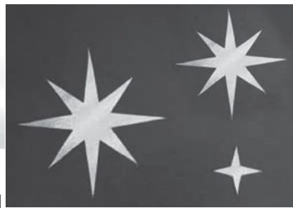
Large Gold Ceiling Stars ($500 each) Medium Gold Ceiling Stars ($250 each) Small Gold Ceiling Stars ($125 each)