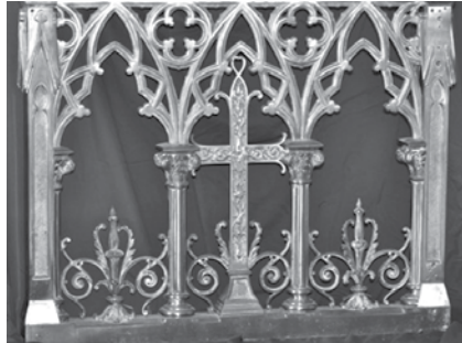
Beautiful Bronze Altar Rail Gates (European craftsmanship from the 1800s) ($2000 each)