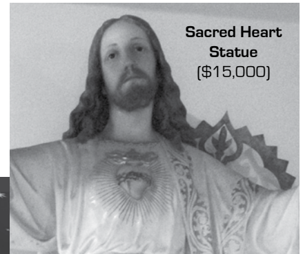
Sacred Heart Statue ($15,000)

The altar represents the Body of Our Lord, and is, therefore, to be fully clothed except during Passiontide. We need a minimum of two frontals: one gold and one purple. (call for price)