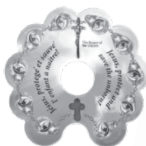
Rosary Finger Card