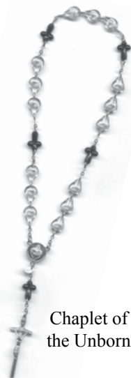
Chaplet of the Unborn